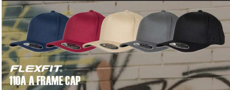
FLEXFIT® 110A A FRAME CAP

Our FLEXFIT® 110A 5 Panel A Frame Snapback Cap is light weight and stylish. Using our Flexfit® technology along with an adjustable snapback making it ideal for that comfortable and personalised fit.