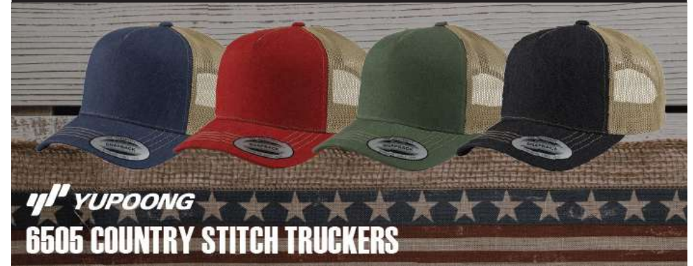
YUPOONG 6505 COUNTRY STITCH TRUCKERS

Flexfit® & Yupoong premium headwear is the blank cap of choice and the preferred cap when rebranding, for private labels and corporate business.