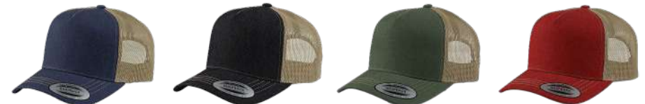
NAVY DENIM/ KHAKI